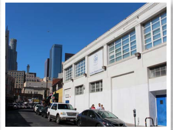
Cardinal Manning Center (CMC).

24,446 drop-in center visits by unhoused individuals and got 48 residents into permanent housing.