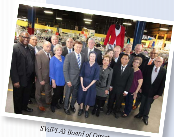
SVdPLA's Board of Directors.

Thrift Stores in LA and Long Beach gave $151,949 worth of free merchandise to the poor.