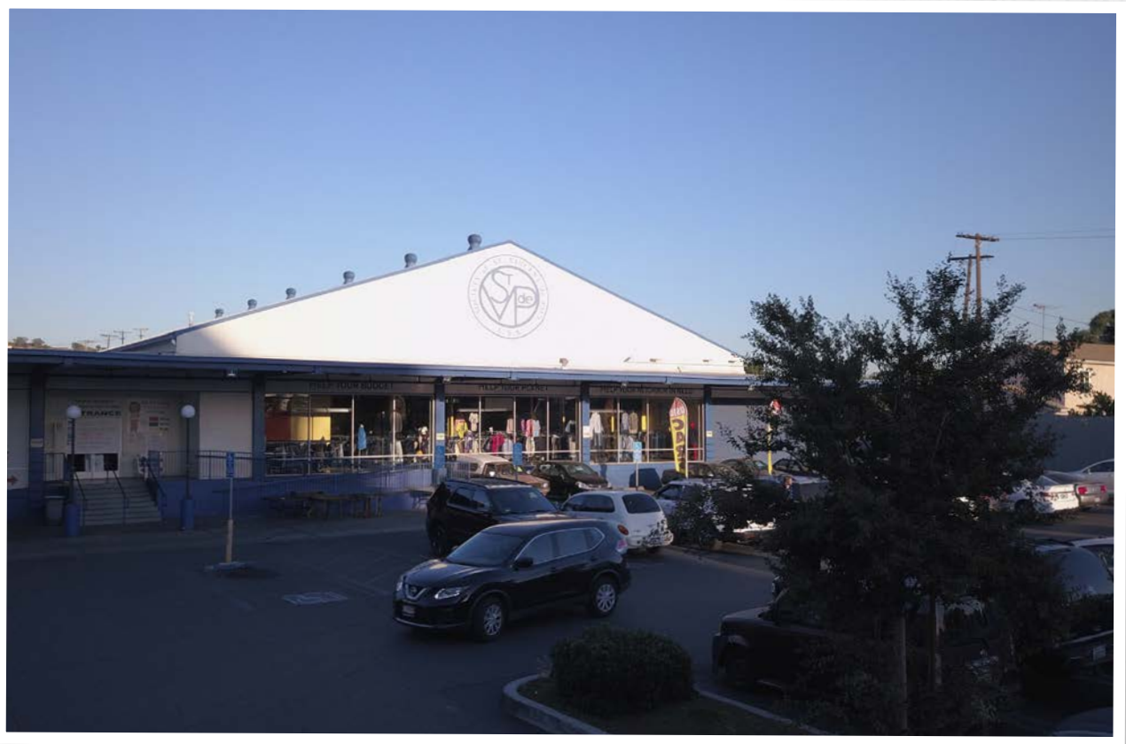
SVdPLA's Los Angeles Thrift Store.