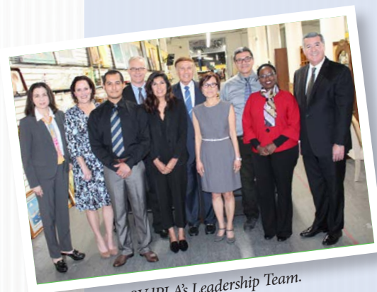
SVdPLA's Leadership Team.